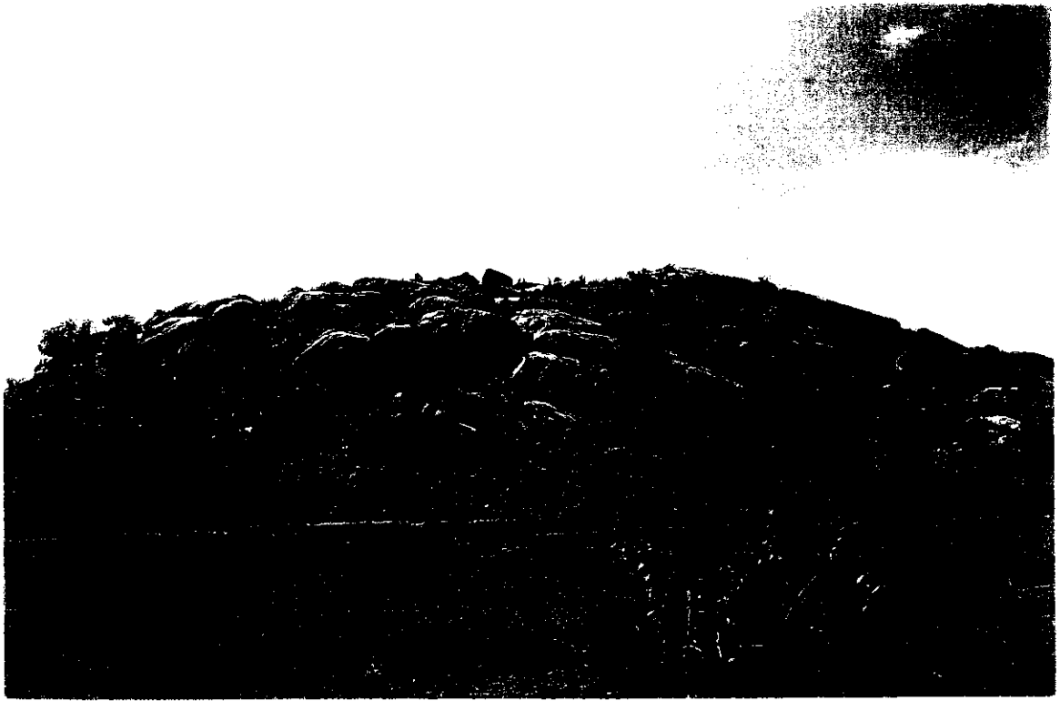
PHOTOGRAPH SHOWING THE CLOSE VIEW OF THE BOULDERS ON THE PEAK OF THE HILL